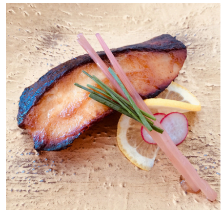
Black Cod with Miso