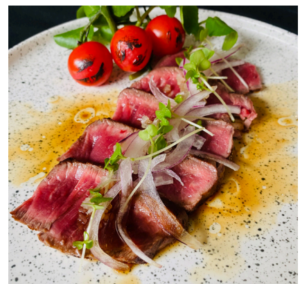
Beef Tataki with Onion Ponzu Sauce

**Chef's Recommendation G: Gluten Free V: Vegetarian